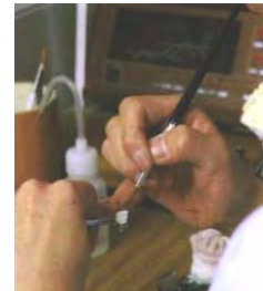
Shock absorber for dental die-casting