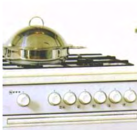
Heat insulation material inside kitchen utensils