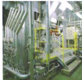
Packing inside high temperature machines