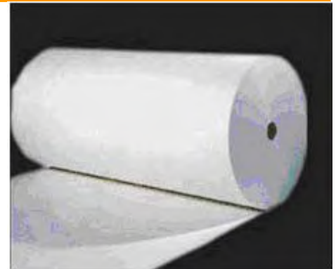
Ceramic paper roll

It possesses adequate elasticity and shock absorbing capacity making it suitable as a buffer or cushion material for high temperature applications.